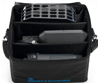
R&S®HE400Z3 transport bag (large).